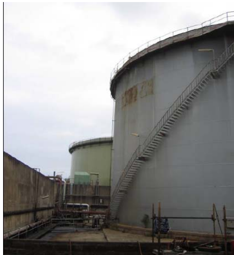
Crude Oil Tanks –a Source of Waste Oils

Hydrocarbon waste is an ongoing and growing environmental problem throughout the world. Australia is no exception. Recycling companies currently collect over 250 million litres of waste oil in Australia, and an estimated 75-80% of this material is recycled into a useful product. The remaining 20% still needs disposal.