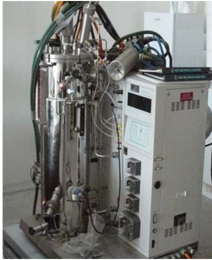
Fermentor for COMclean production

Recent trials conducted at Flinders University Environmental Biotechnology Unit examined the potential of COMclean to remediate waste oil, by comparing the time COMclean took to treat waste oil compared with current practice. Figure 1 shows the findings of this study.